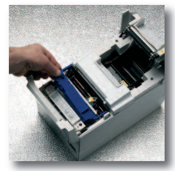
Top or Bottom MICR