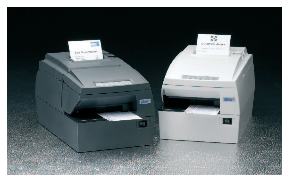
HSP7000 - The Functions You Need At The Price You Can Afford

Star Micronics is proud to announce another addition to its extensive product line of POS printers. The multifunction (hybrid), HSP7000.