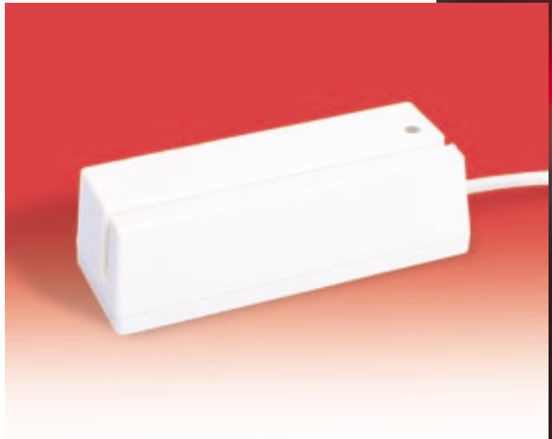
MAGNETIC STRIPE AND BAR CODE SLOT READER

Using the reader is easy. Simply "swipe" the card through the slot in either direction. The reader is