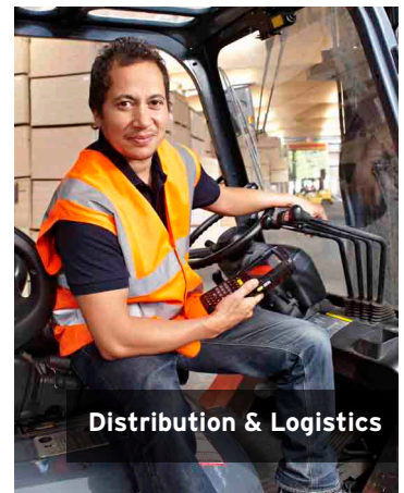
Distribution & Logistics