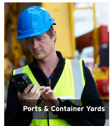
Ports & Container Yards