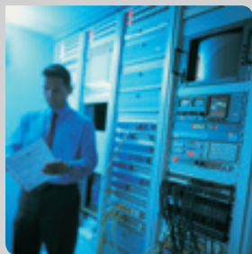
Field Force Automation