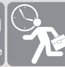
Work Order Tracking