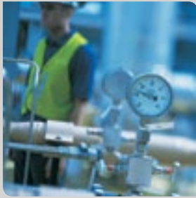
Field Force Automation